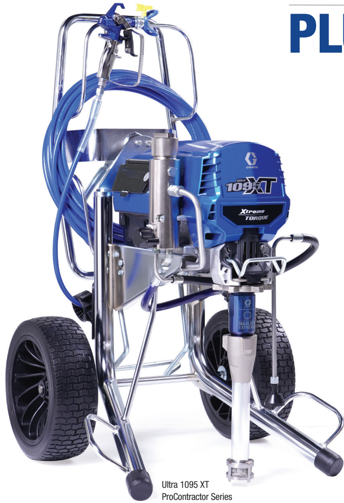
Ultra 1095 XT ProContractor Series