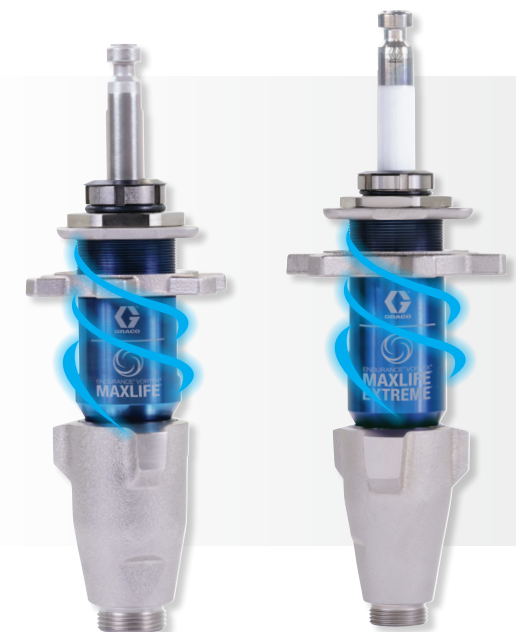
Endurance Vortex MaxLife Pump 6X longer between repacks