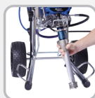
Open Door & Remove Pump