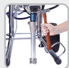
Loosen the Clamping Nut