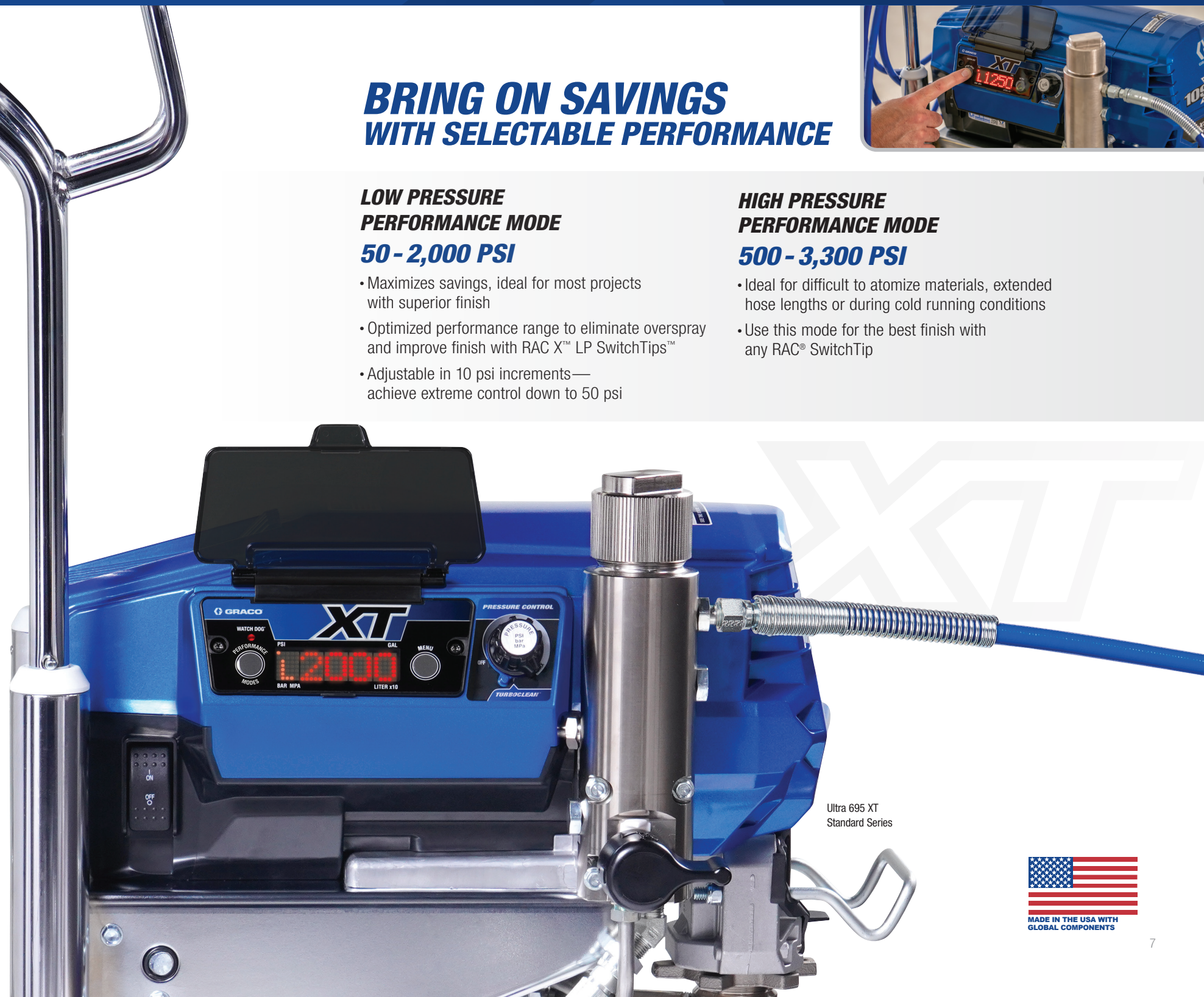
Ultra 695 XT Standard Series